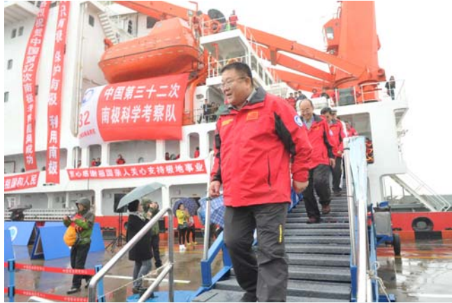
CHINARE 32 Members land from Xue Long

China will develop a fleet of such fixed-wing aircraft, for