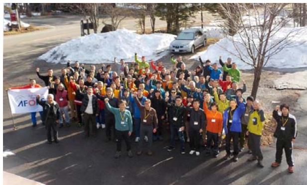
Winter Training for JARE58 Candidates

now having medical examination and the results will be as-