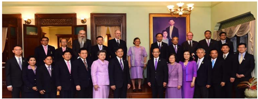
MOU Signing between UNIS and Chulalongkorn University