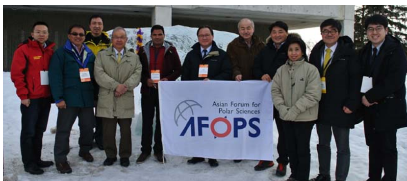
Special Meeting (AFoPS-XVII) Participants

The Members agreed to hold another special meeting in conjunction with SCAR OSC in August, to prepare for the AGM and transfer of the secretariat to the next chair. (Secretariat)