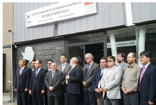
Opening of Chile-Korea Antarctic Cooperation Center

operation between the two countries in Antarctic sci-